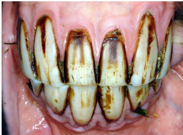
Front view of 20-year-old horse

Have your veterinarian examine and “float” (file) your horse’s teeth at least once a year — twice annually if your horse is over 20 years old.