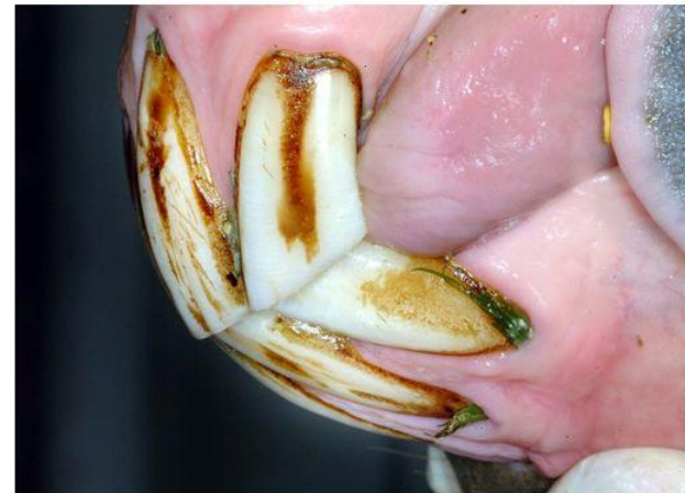
Side view of 20-year-old horse